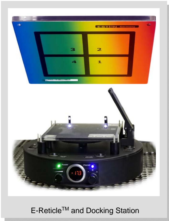
E-Reticle™ and Docking Station

Fabricated in a standard 6 inch reticle form factor, the E-Reticle™ can be run through many of the mask shop manufacturing, metrology and cleaning tools to determine areas of potential risk. The E-Reticle™ can also be loaded on to scanner lithography tools from ASML, Canon or Nikon as the required tool marks have been incorporated into the reticle design